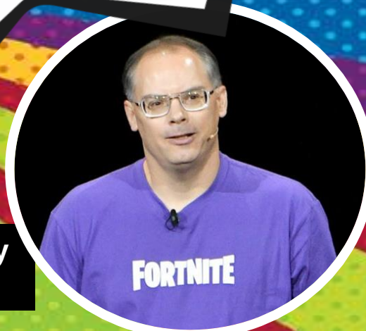
Tim Sweeney Fortnite