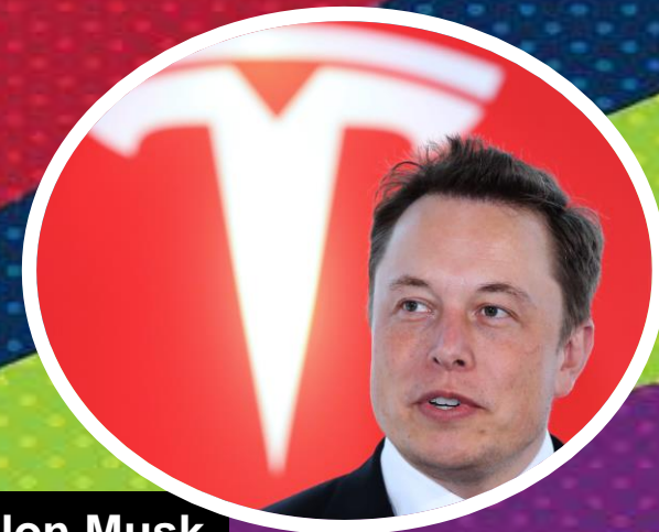
Elon Musk Tesla