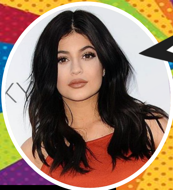
Kylie Jenner Kylie Cosmetics