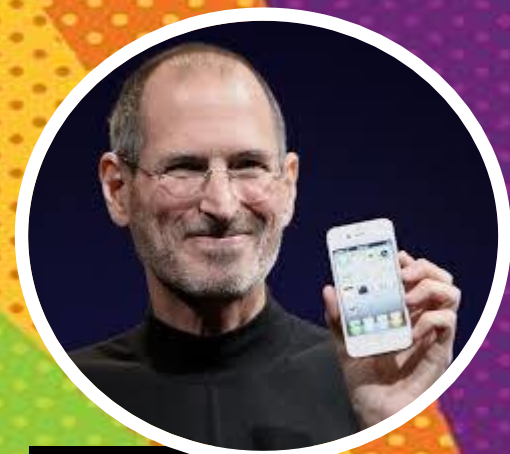
Steve Jobs Apple