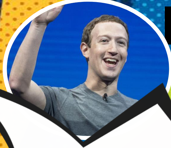
Mark Zuckerberg Facebook